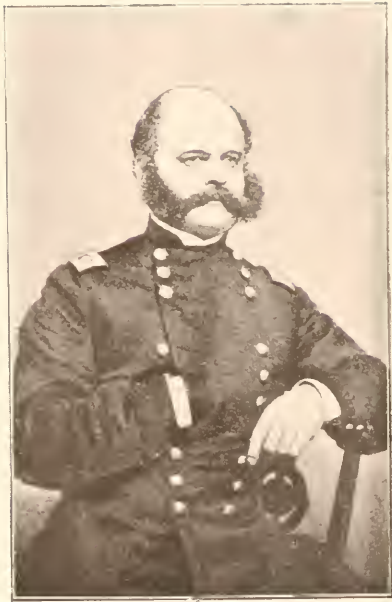
MAJOR GENERAL A. E. BURNSIDE, U. S. A.